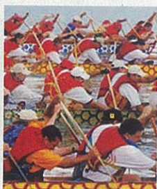
Barrie Dragon Boat Festival