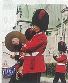
Quebec City International Festival of Military Bands