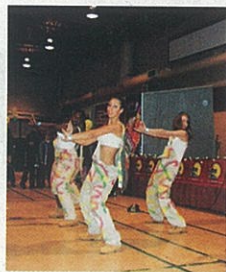
Calgary International Reggae Festival